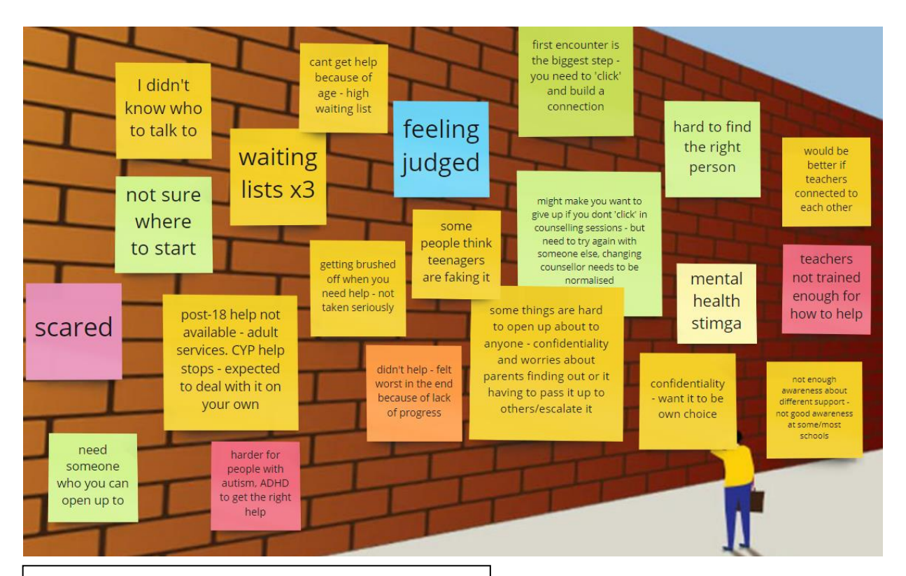
Barriers Miro Board from Bristol focus group

One young person explained the CAMHS service they had accessed "didn't understand me and my ADHD," while a young person from a different site explained how it was "harder for people with autism [and] ADHD to get the right help."